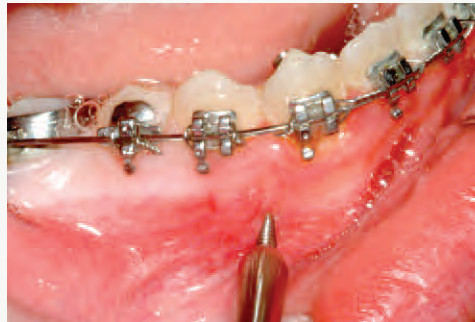
The site for the TAD is selected.

Because of the possibility that TADs can loosen or fall out, patients should avoid picking or pulling at the TAD. If the TAD does become loose or come out, call your orthodontist as soon as possible.