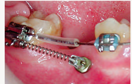
A TAD serves as an anchor to perform difficult tooth movements predictably.

Because orthodontists have the training and expertise to place them, many orthodontists place TADs themselves. This ensures the TAD is placed exactly where the orthodontist wants it. Some orthodontists may choose to have a TAD placed by another dental specialist.