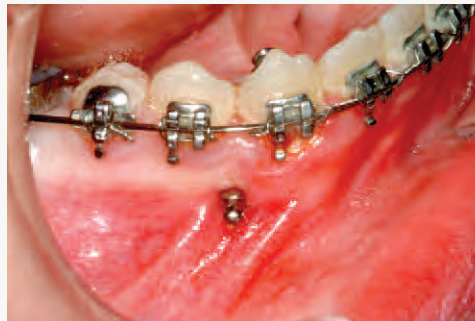
The TAD immediately after placement.